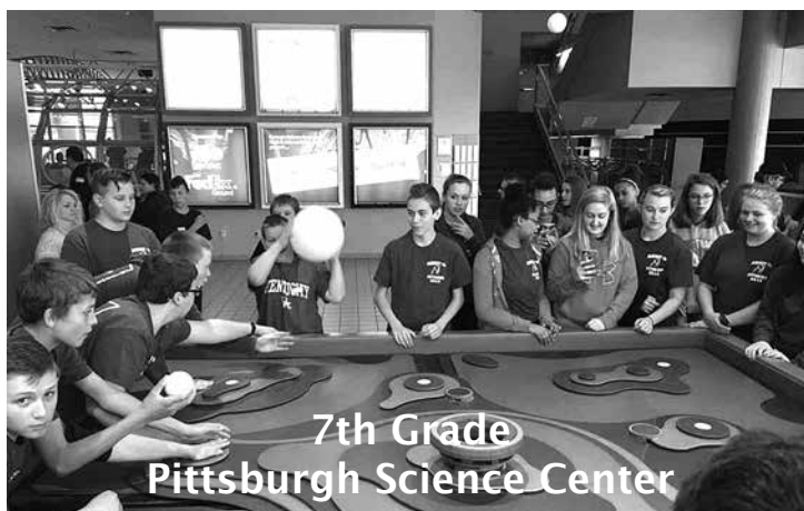
7th Grade Pittsburgh Science Center