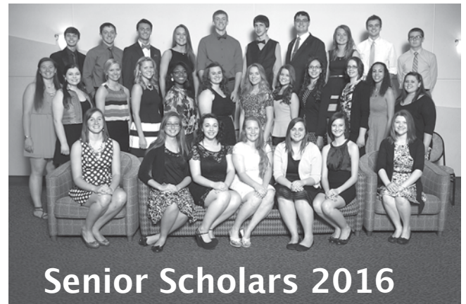
Senior Scholars 2016

The Senior Scholar Recognition Dinner was made possible through the generosity of Kent State University at Stark.