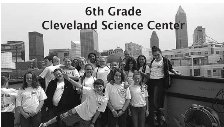
6th Grade Cleveland Science Center