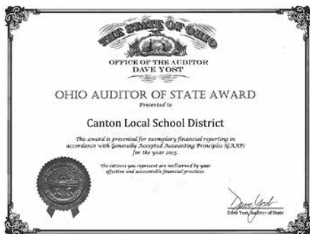
Left: Ohio Auditor of State Award to Canton Local School District