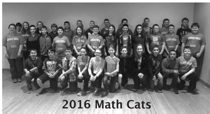
2016 Math Cats