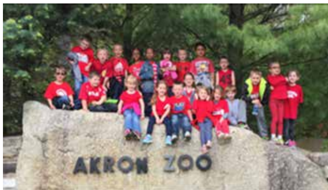
Kindergarten students visited the Akron Zoo this spring.